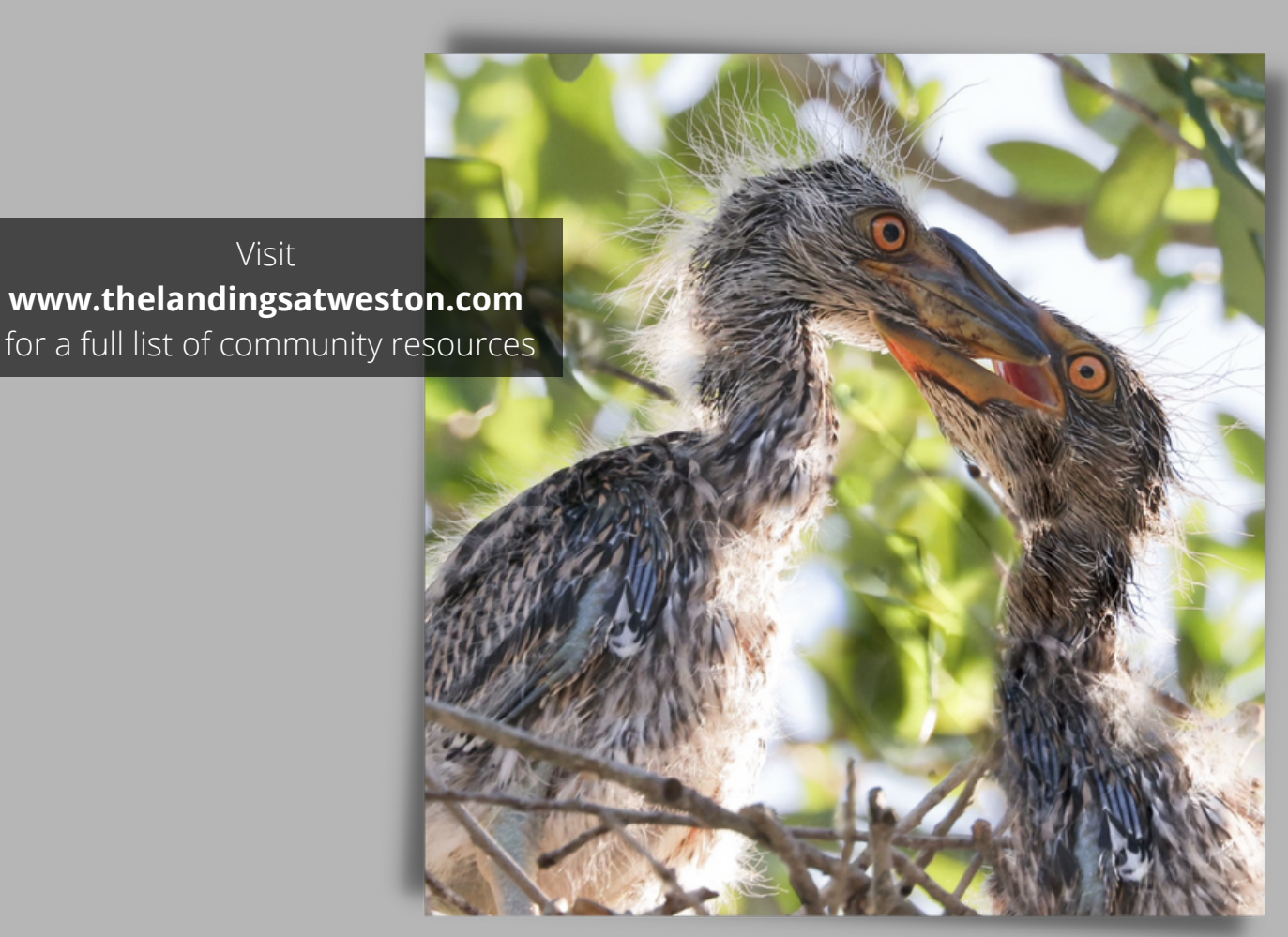
Yellow-crowned Night Herons born in the Landings March of 2022.