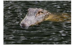
Alligator Sightings Please Be Careful Near the Lakes